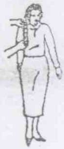
SHOULDER TO BUST

Measure from shoulder seam to jacket length