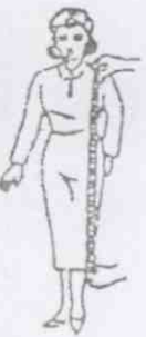
TOP COAT LENGTH

Measure from center shoulder to back waist